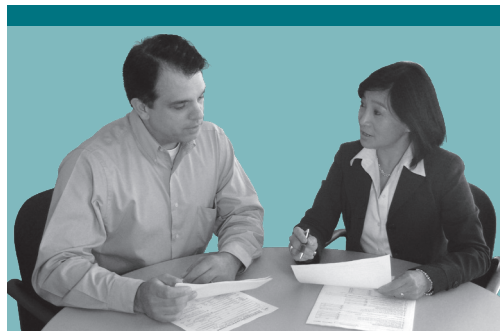
TR-24 (8/15) (back)

Use your Online Services account or call us at (518) 457-5434 to learn more.